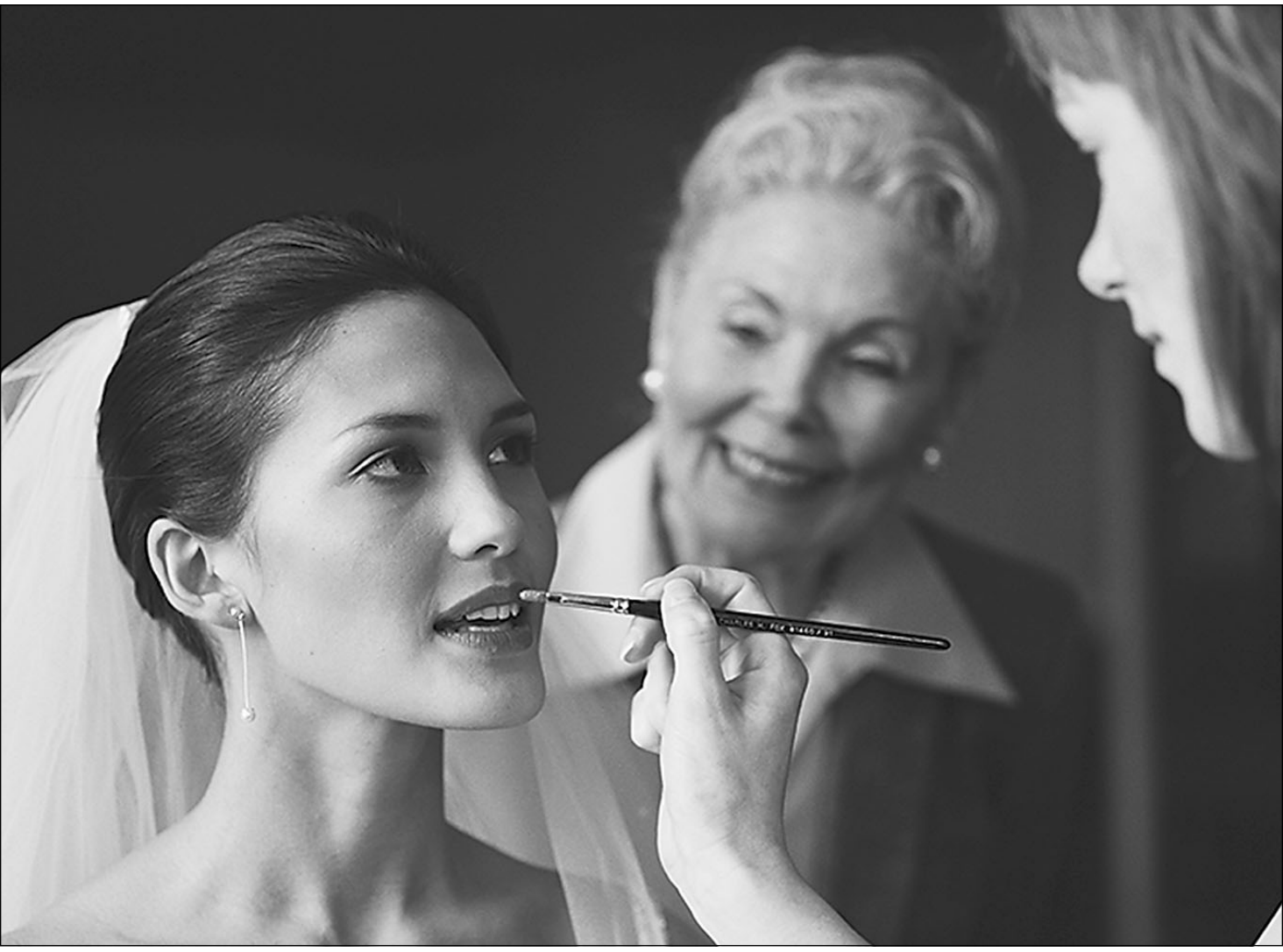
Metro Creative Services

A wedding day can bring plenty of “stresses,” but having a timeline set up is one of the best ways to make sure the big day comes off without a hitch.