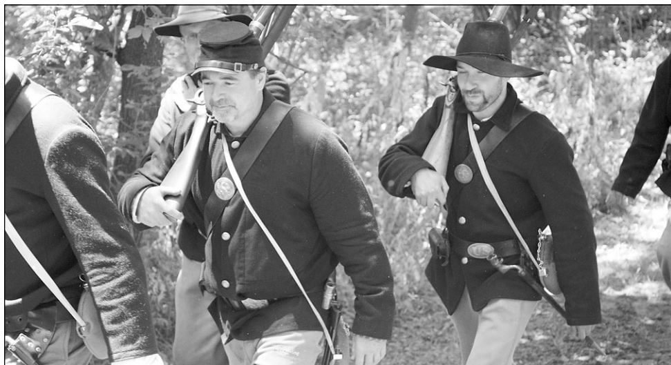
Union soldiers march into battle during the annual Civil War Re-enactment on Sunday afternoon.

"I love it, I've been doing reenactments for 30 years," he said. Which might have