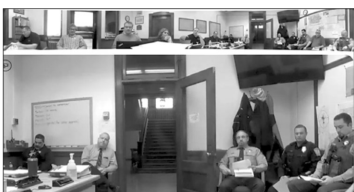
This is the view viewers see when they turn into the live streaming of Chickasaw County Board of Supervisor meetings.