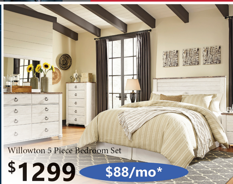
Willowton 5 Piece Bedroom Set