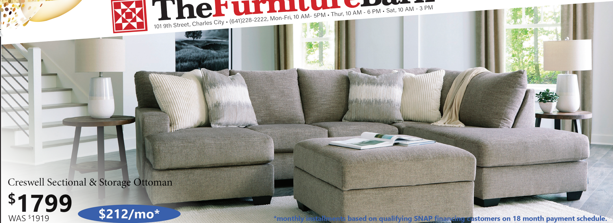
Creswell Sectional & Storage Ottoman

The Furniture Barn 101 9th Street, Charles City • (641)228-2222, Mon-Fri, 10 AM - 5 PM • Thur, 10 AM - 6 PM • Sat, 10 AM - 3 PM