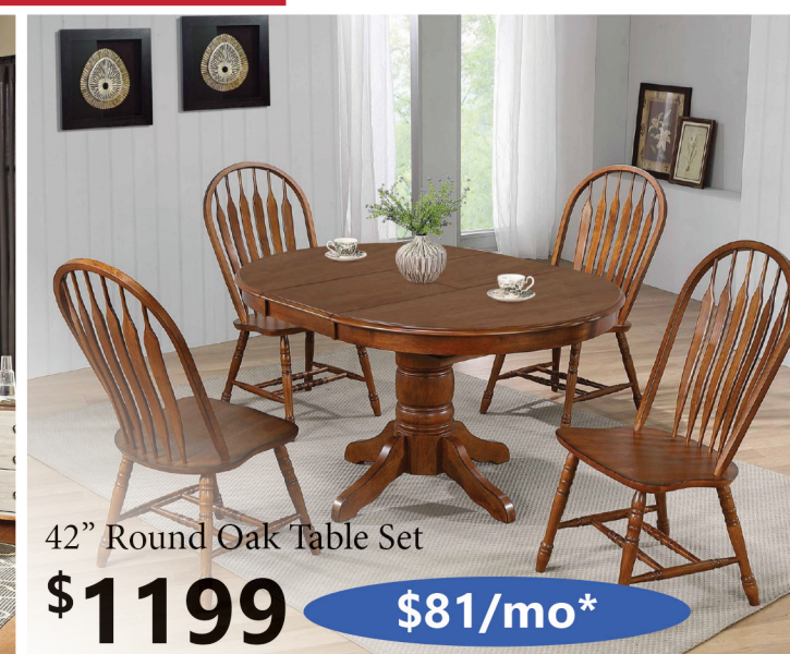
42" Round Oak Table Set