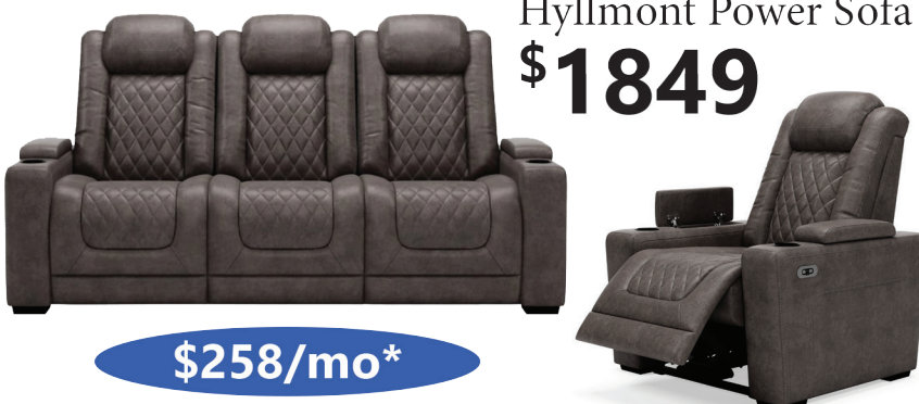
Hyllmont Power Sofa